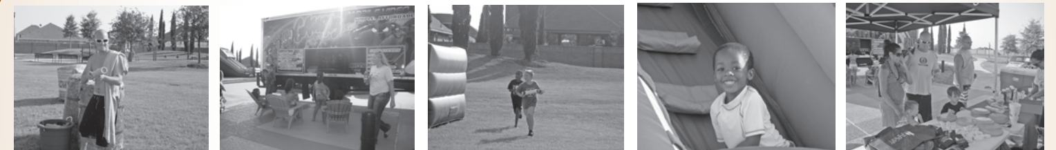
A big back to school thank you to JSC Federal Credit Union and Kiddie Academy for sponsoring Back To School Madness!

Before heading back to school, Tuscan Lakes' residents enjoyed two hours of adrenaline pumping fun at the Cypress Point Recreation Center with laser tag and video games! And, to cool off from the heat, residents enjoyed floating in front of a big screen at our dive-in movie Diary of A Wimpy Kid .