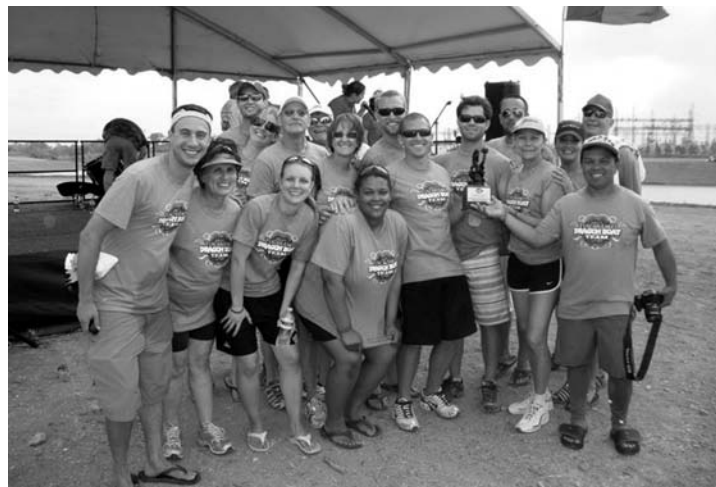
Tuscan Lake Dragon Boat Team - Wins the Edgewater Dragon Boat Challenge