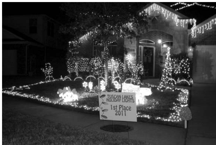
1ST PLACE: 2731 Palermo Ct.

Thank you to everyone that helped make Tuscan Lakes a festive place during the Holiday Season! Congratulations to the following houses for placing in the top 3. Winners received a Holiday Lights yard sign and will receive a gift card in the mail! Big thank you to the judges that volunteer their time for the contest.