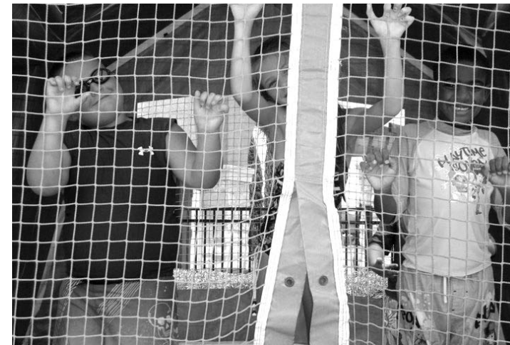
Back 2 School Bash - Kids enjoyed their last days summer with a inflatable slide, water laser tag and mobile video games