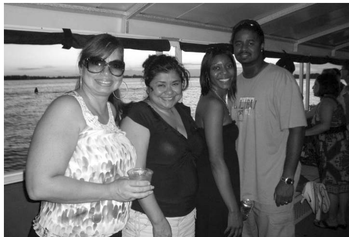
Cruise the Bay Adult Mixer - Adults got to have some fun cruising the bay with neighbors and friends on the Houston Party Boat