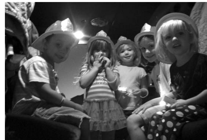
National Night Out Block Party - Tuscan Lakes residents got out and met their neighbors and the local LCPD and Fire department