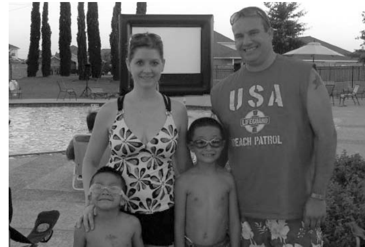
Summer Dive-In-Movie - families kick back and enjoyed a movie pool side

The Johnson Development Corp. is an award-winning residential and commercial land development company involved in premier projects including master-planned communities such as Sienna Plantation, Fall Creek, Riverstone, Woodforest, Tuscan Lakes, Edgewater and Silverlake in Houston, Texas, and Towne Lake, BridgeMill and Lake Arrowhead in Atlanta, Georgia. Established in 1975, known for innovative master planning and today one of the largest and most successful land developers in both Houston and Atlanta, The Johnson Development Corp. has cultivated a strong reputation for vibrant, responsible development, with impeccably designed communities. For more information, visit www.johnsondevelopment.com .