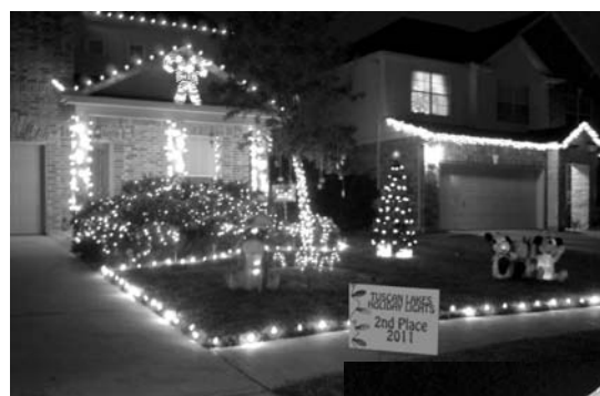
2ND PLACE: 974 Umbria lane