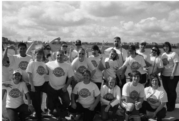
Tuscan Lakes Amazing Race – 18 teams race throughout Tuscan Lakes solving puzzles and completing fitness challenges

2011 was a terrific year for the Tuscan community. Thank you to AMOCO Federal Credit Union, JSC Federal Credit Union, Harwood Homes, Newmark Homes, KB Home, Houston Party Boats, Kiddie Academy & Fusion MBS for your support of the Tuscan Lakes Community events!