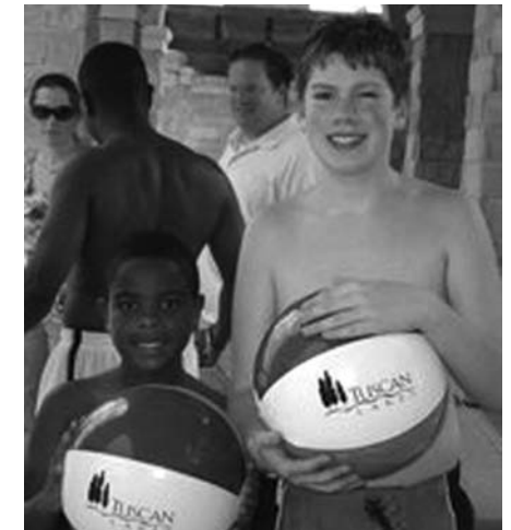
4 th of July family fun fest - Tuscan Lakes celebrated the nations Independence day with a Dj, games and food