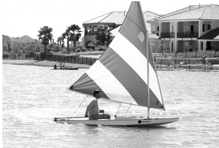
Kayak Extravaganza - family and friends enjoy the beautiful lake Lago with kayak demos, music, hotdogs and a moonwalk