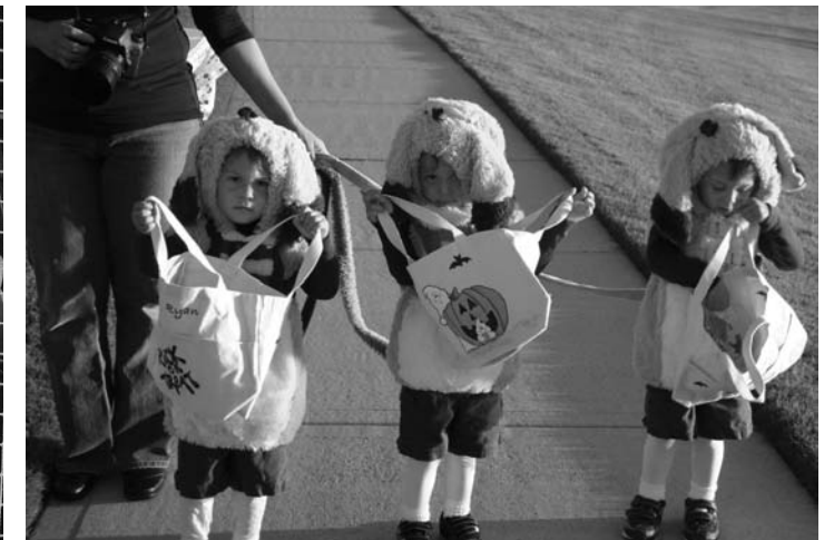
Halloween Trail of Treats - 300 plus walked the 3 rd Annual Trail of Treats with a Haunted House, Pest costume contest and tables filled with goodies for all.