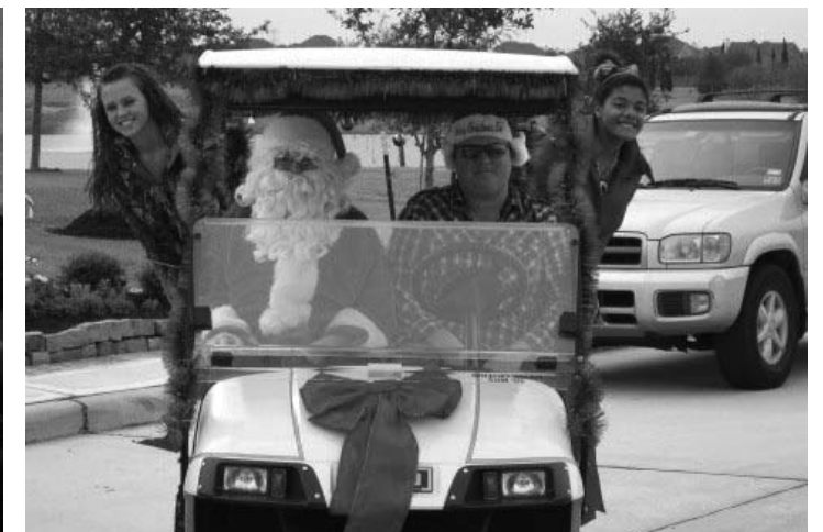
Holidaypalooza - Tuscan Lakes residents got into the holiday spirit with Santa, holiday arts & crafts, music and games